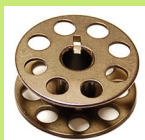
Optional "L or M" bobbin