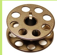
Add "M" sized bobbin and hook assembly for $250.00