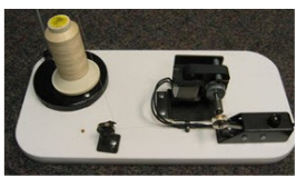
Bobbin winder for both "L" or "M" sized bobbins

The Nolting commercial steel frame. We deliver the machine and frame to your home and provide setup, testing and training. Along with this you get a free bobbin winder, extra bobbins, oil, patterns and a free day of training by our professional quilting trainers.