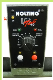
IS TURBO CL Stitch regulator